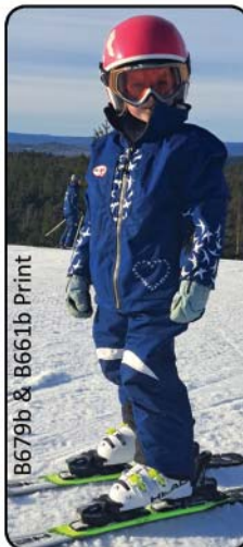
B679b & B661b Print

B679b , Kids model of B629b, but with regular liner. Sizes: 110-170.