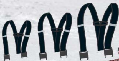
B299 - "Add on" suspenders