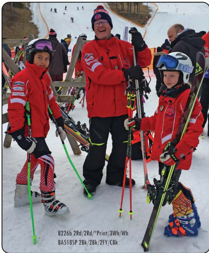
B226b 2Rd/2Rd/*Print/3Wh/Wh BA518SP 2Bk/2Bk/2FY/CBk