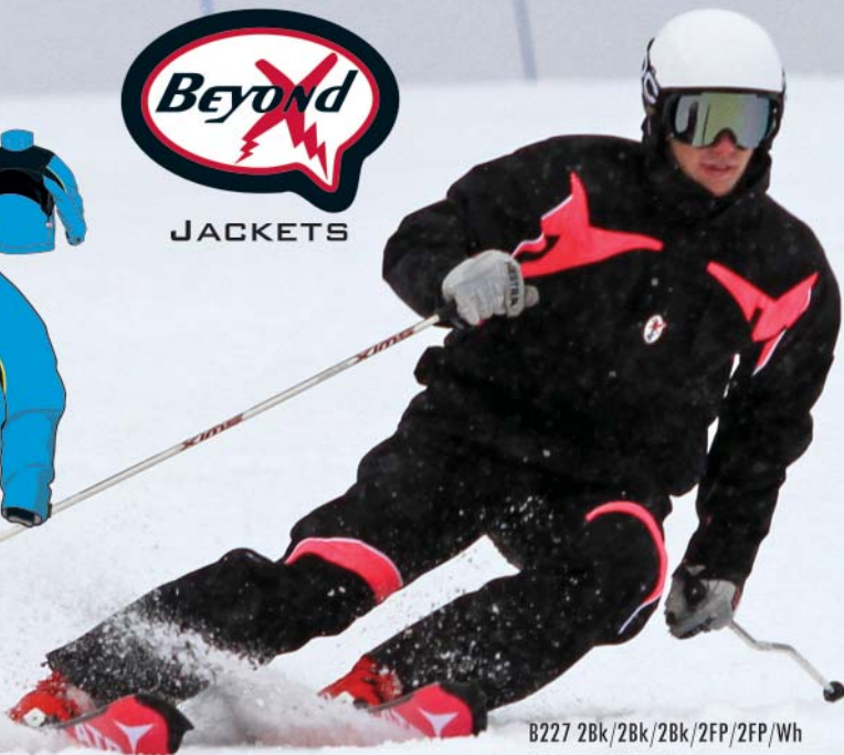
B227 2Bk/2Bk/2Bk/2FP/2FP/Wh B418 2Bk/2FP/Wh