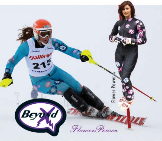
Flower Power A