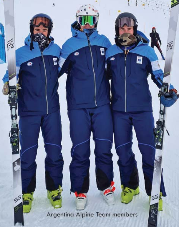
Argentina Alpine Team members