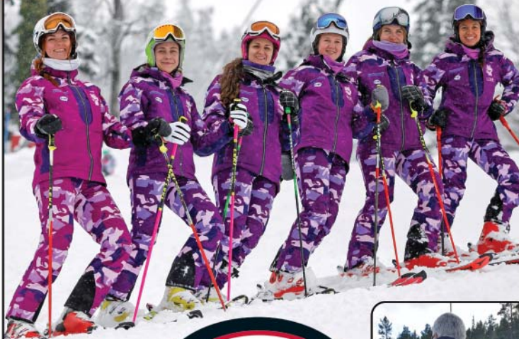
B629b, B692b &amp; B613b Print