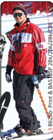
B628b- Print & BA518SP 2Bk/2Bk/2Bk/CBk