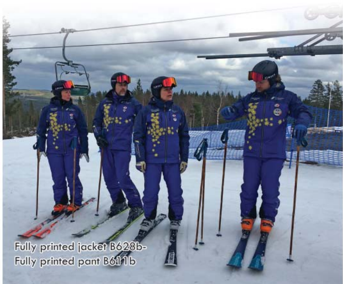
Fully printed jacket B628b- Fully printed pant B611b

Our light and flexible fabrics offer 20.000mm water resistance and 20.000g/m 2 /24h air permeability, in 2- or 3-layer fabrics.