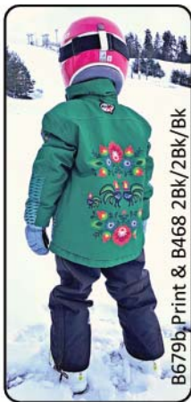
B679b, Print & B468 2Bk/2Bk/Bk

B628b- , Shell jacket in 3-layer fabric with water resistant zippers, chest pockets, side pockets, inside pocket and key card pocket. Snap attachment for optional B691b-/B692b hood. Sizes: Unisex XS-XXL.