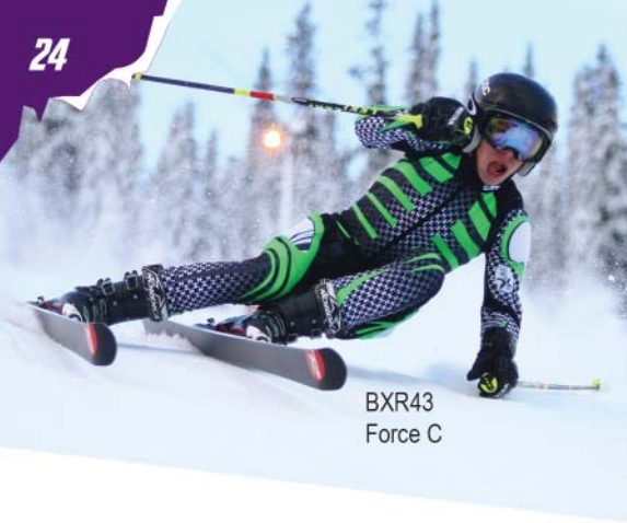
BXR43 Force C