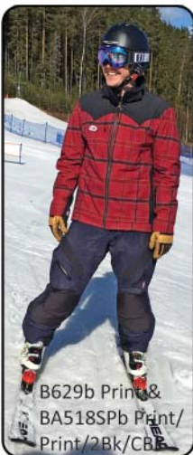
B629b Print & BA518SPb Print/Print/2Bk/CBk

B629b , Insulated jacket in 2-layer fabric with function liner, water resistant zippers, chest pockets, side pockets, inside pocket and key card pocket. Snap attachment for optional B691b-/B692b hood. Sizes: Unisex XS-XXL.