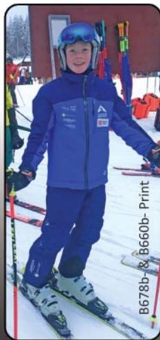
B678b- &amp; B660b- Print

B661 , same kids pant as B661b-, but unprinted.