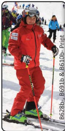
B628b-, B691b & B610b- Print

B678b- , Kids model of B628b-. Sizes: 110-170.