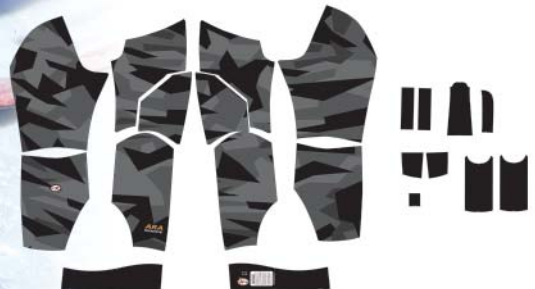
B628b- Print. BA518b Print/2Bk/2Bk/CBk.