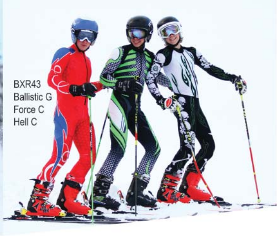
BXR43 Ballistic G Force C Hell C

For FIS suits, FIS advertising rules must be considered. No single sponsor logo shall exceed 100 cm 2 . The logo must fit inside a 100 cm 2 rectangle. Total surface of all sponsor markings shall not exceed 450 cm 2 . Remains 370 cm 2 once the three mandatory Beyond-X logos on the suit, have been deducted. No sponsor marking in the bib area.